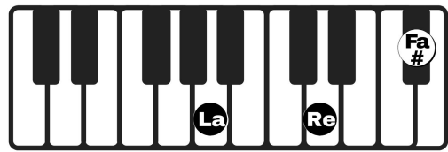
D = re maior