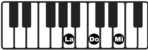
Am = la menor